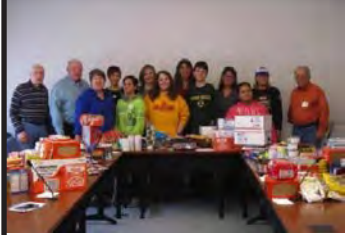
Leos and Ann Arbor Host Lions team up to spread holiday cheer to overseas troops.