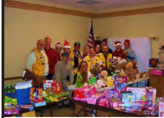
Toys lined up and ready for over 100 children courtesy of Kal Haven Lions.