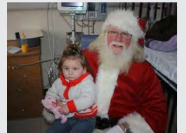
Santa visits a young patient at the Grayling Mercy Hospital