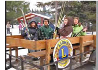
Roscommon Higgins Lake Lions at the annual Michigan Ski for Light event