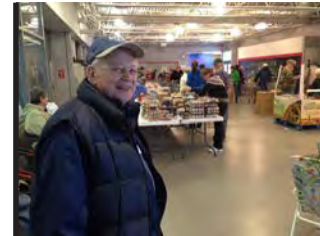
Midland Lions at the Midland County Emergency Food Pantry Network