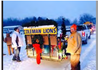
Coleman Lions' display at the annual Coleman Christmas Parade